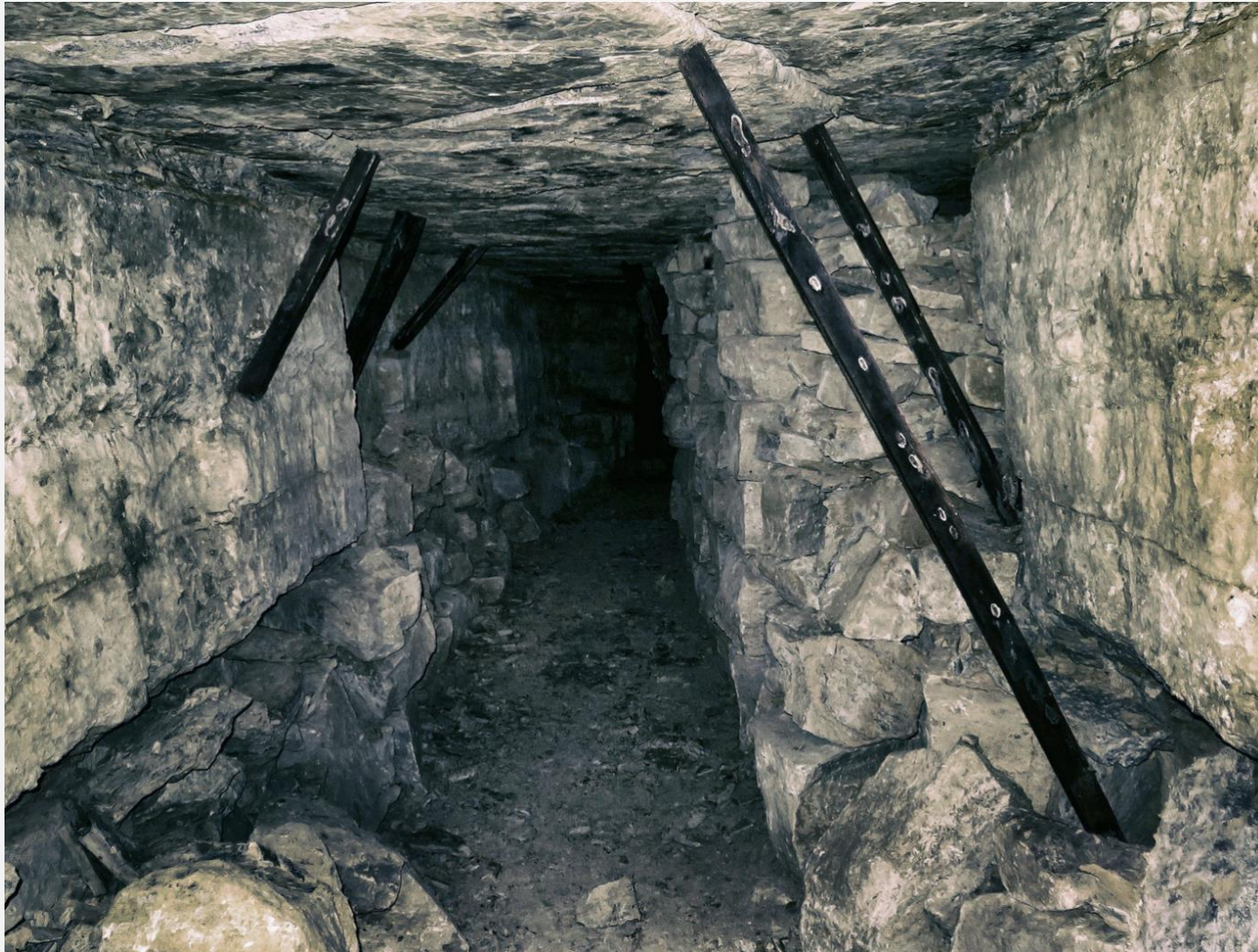
Broadmead Underground Quarr worked in the 50's exposed around 2010.