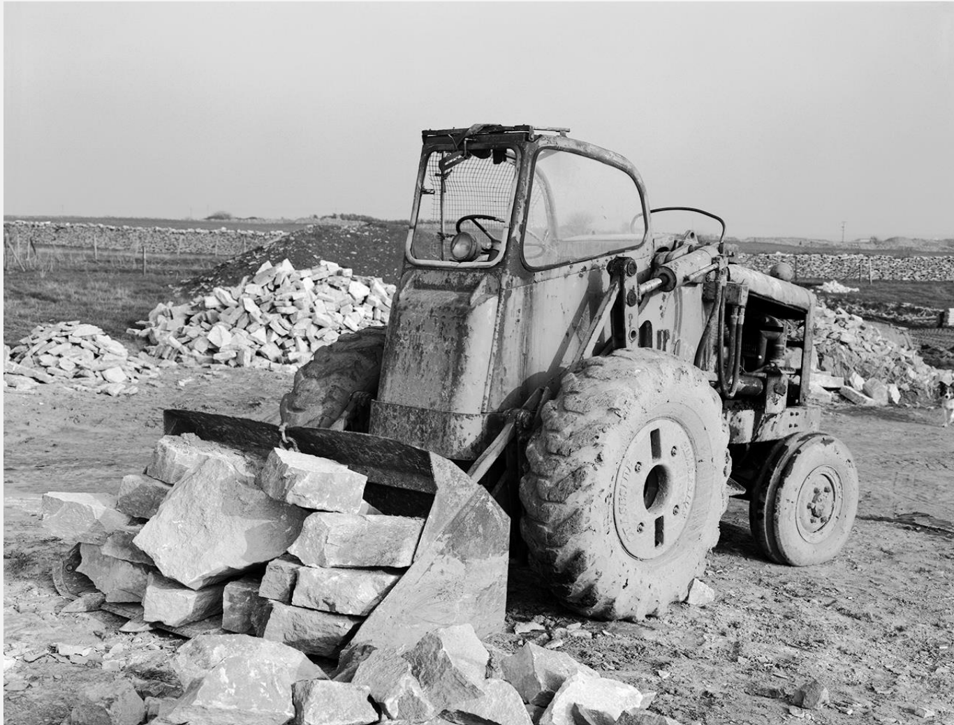
Early Chaside front loader, 1992