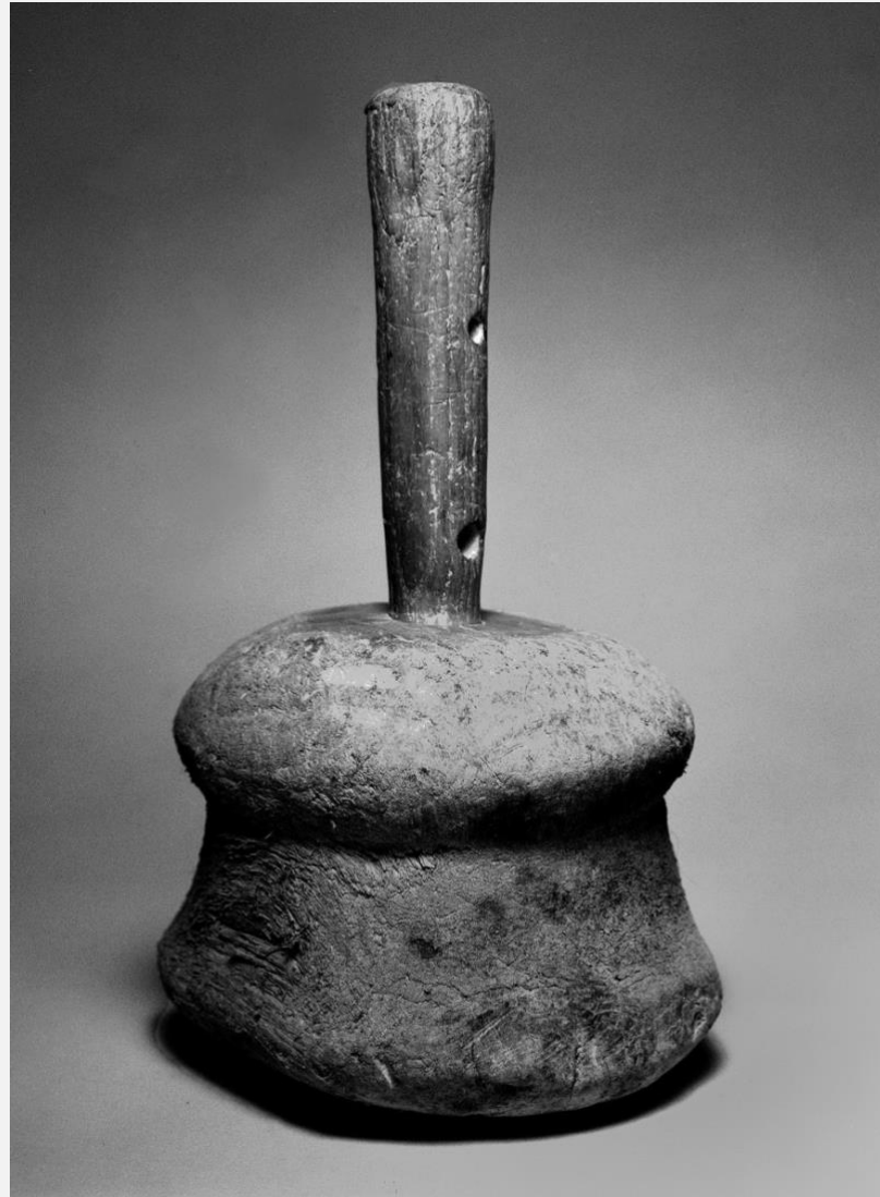
Fred Wellman's apple wood mallet, 1992