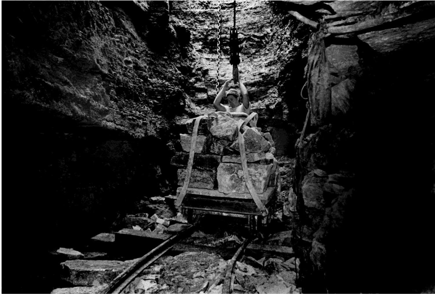
At the foot of the vertical shaft the crane hook is about to be attached to the slings that are attached at the corners of the flatbed cart. 1982