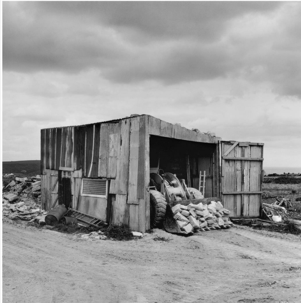
Machinery Shed, Keates Quarry, 1992