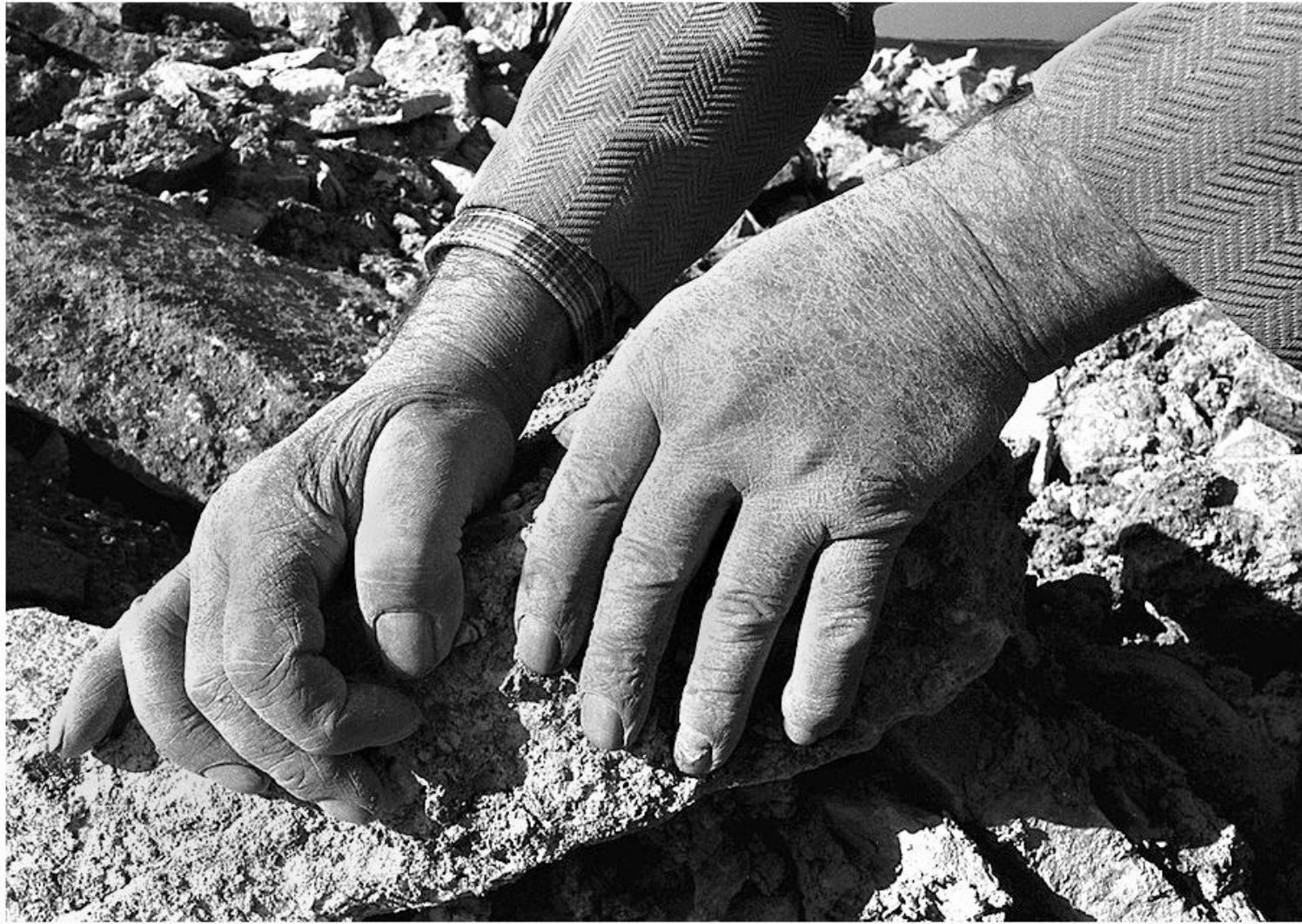
The hardened hands of a quarryman, 1983