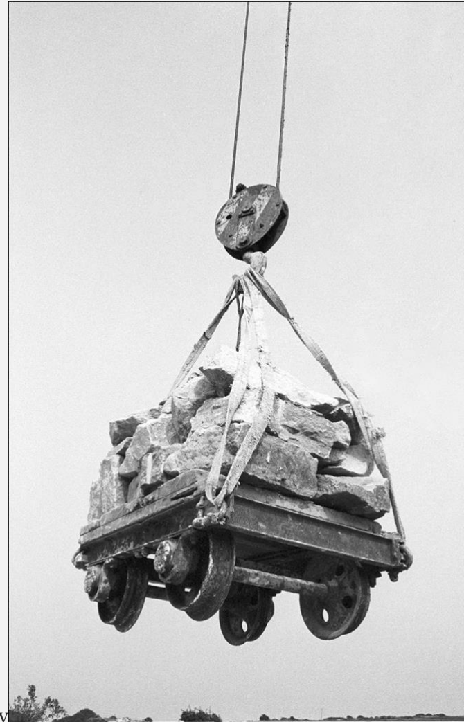
The cart being hoisted by a diesel-powered crane.