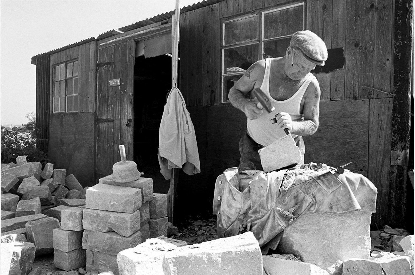
Wellman dressing dubbers. Highlands, Acton 1983