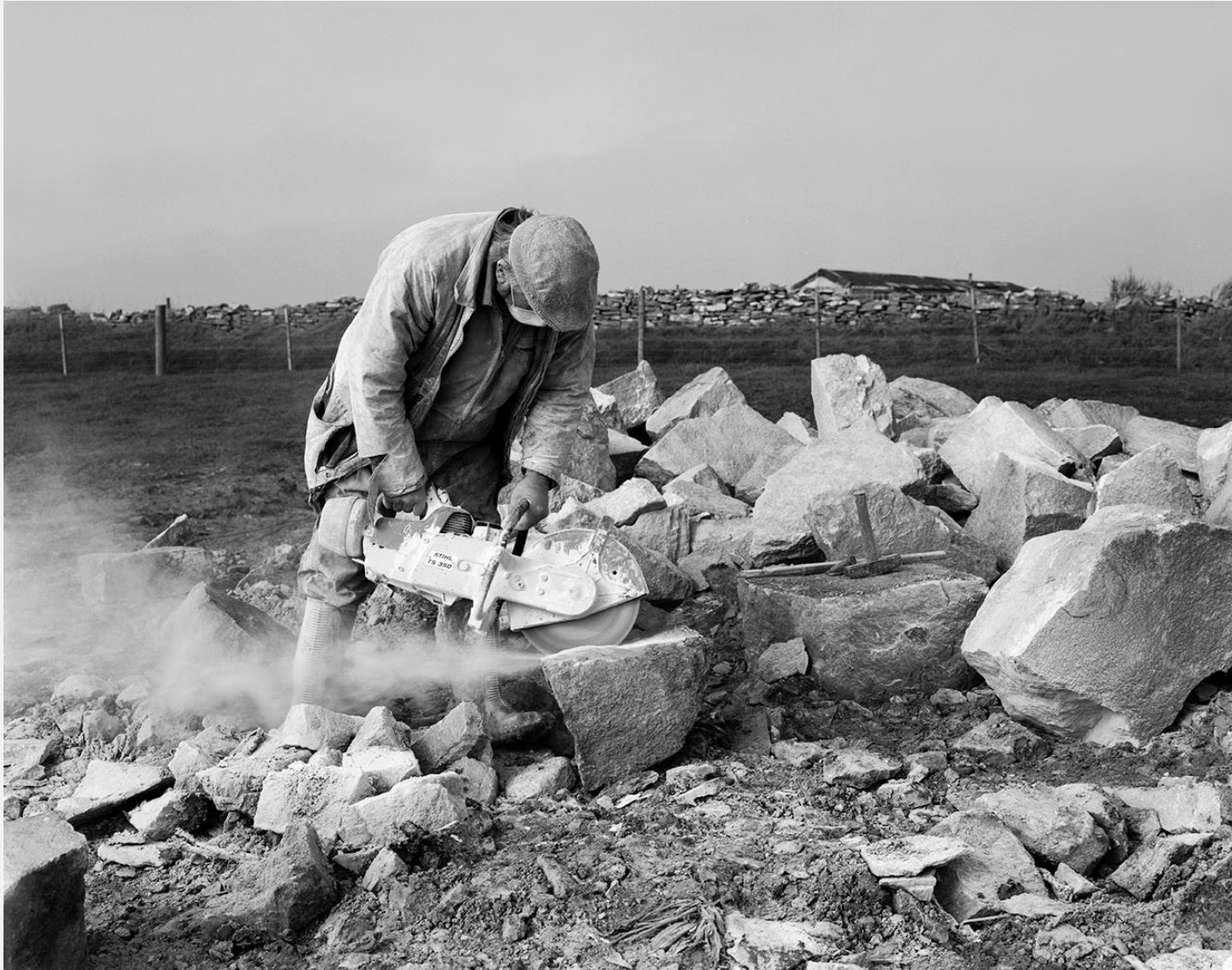
Alan Lander, 1992