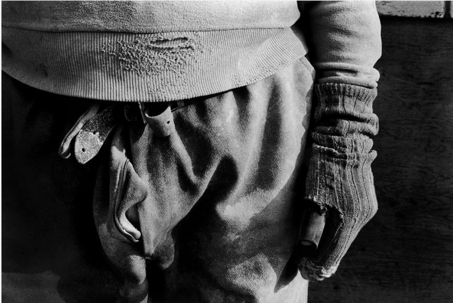
Darned Sock, 1983