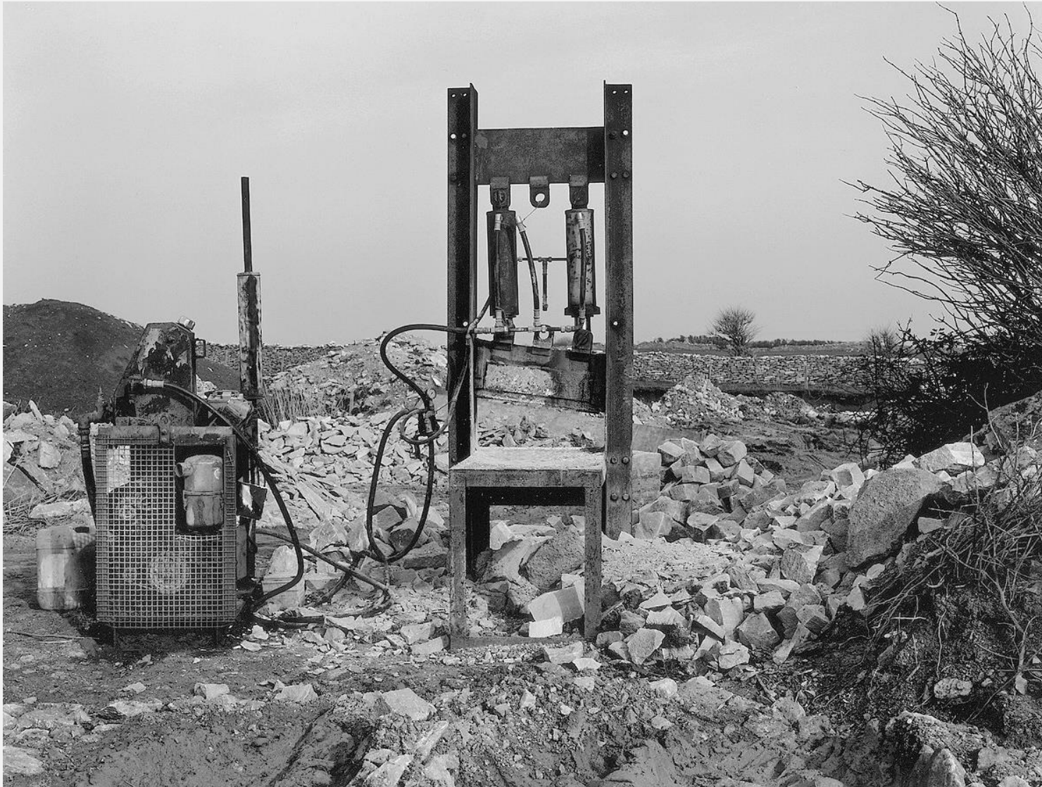
Hydraulic guillotine / stone splitter, 1992